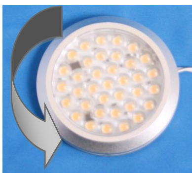
Turn rim anti clock wise