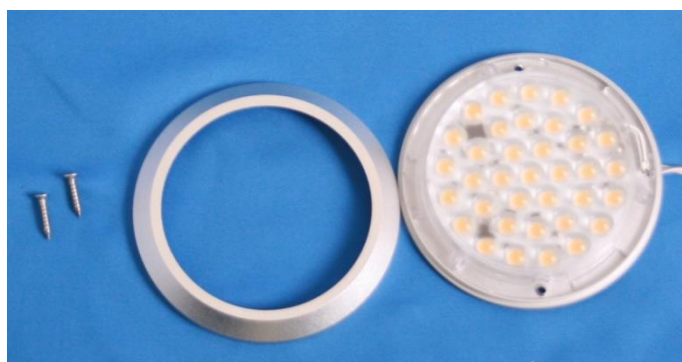
Mounting holes visible